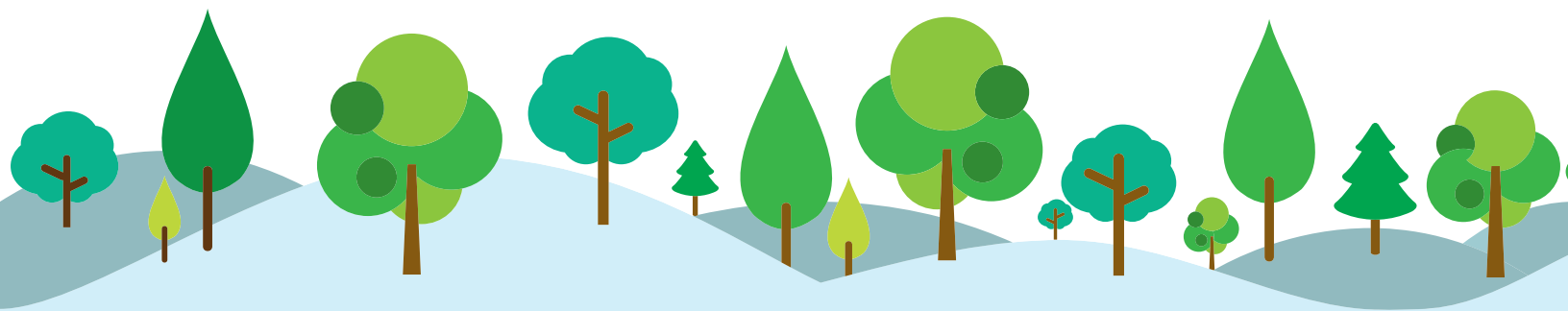
Figure 1: Could I profitably sell carbon offsets from my forest? 3

surpass limits set by the easement to regulate timber harvests and increase carbon stocks. Lands that have been recently harvested and/or have timber volumes below regional averages may have to grow wood for some time before carbon levels are high enough to make offsets profitable. Lastly, project costs make it difficult for small projects (<1,500 acres) to break even. A landowner must determine if these factors serve as barriers to engaging in the carbon marketplace. Figure 1 uses a simple traffic light format to summarize these points and help conservation and municipal landowners easily determine whether forest offsets could make sense for their situation.