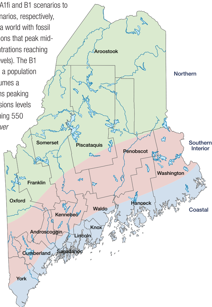
Fig. 1. The three climate zones in Maine: Northern, Southern Interior, and Coastal (from NOAA's National Climatic Data Center and after Jacobson et al. 2009). These climate divisions span 54%, 31%, and 15% of the state's total area, respectively.

Maine's climate has had a major role in determining the distribution of animal and plant species in Maine (Jacobson et al. 2009). There are three major climate zones in Maine (Fig. 1): the Northern zone has a continental climate with cold winters and is influenced by air masses from the west and north; the Southern Interior zone has the warmest summer weather and is influenced by air masses from the south and west; and the Coastal zone has a maritime climate which moderates summer and winter extreme temperatures and is influenced by air masses from the west and south. These three distinct zones will likely persist with climate change (Jacobson et al. 2009).