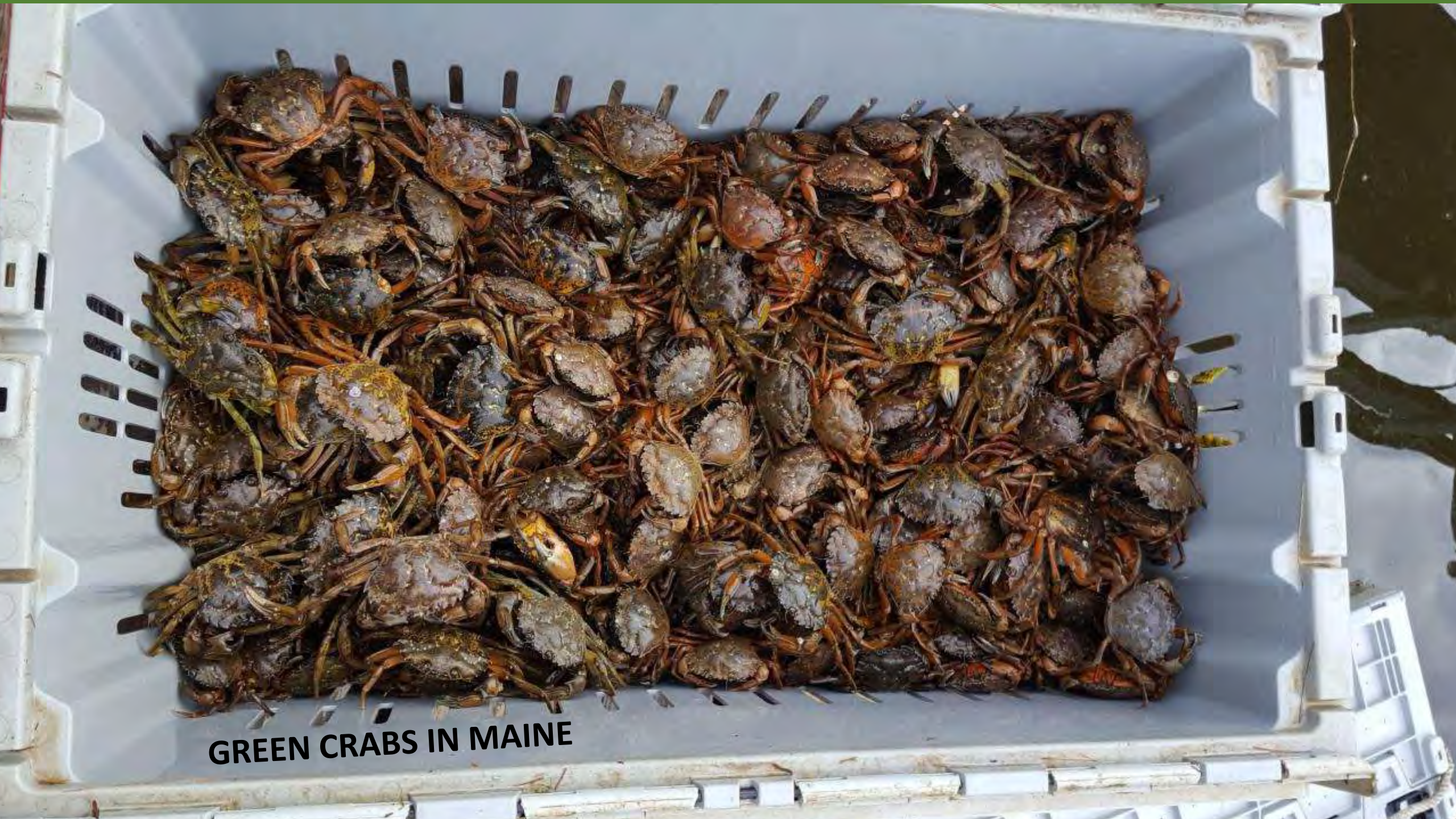
GREEN CRABS IN MAINE