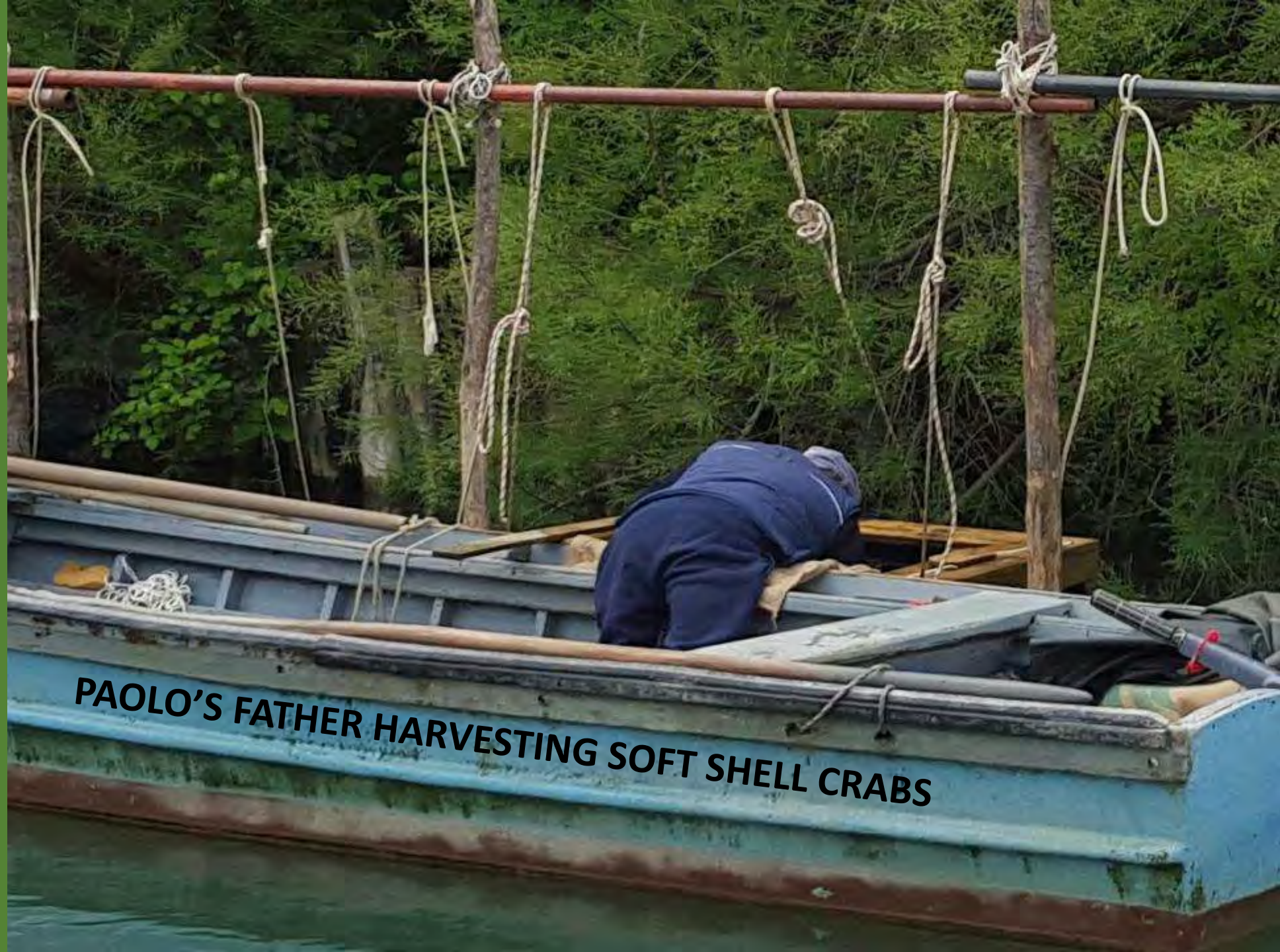
PAOLO'S FATHER HARVESTING SOFT SHELL CRABS